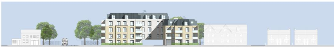
CONTEXT ELEVATION 1