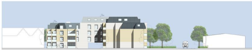
CONTEXT ELEVATION 2